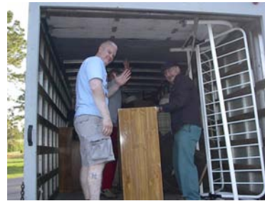
Moving furniture. Lots of furniture.....