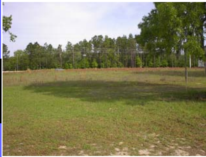
We need Land!

"Behold, I am the Lord, the God of all flesh: is there any thing too hard for me?"