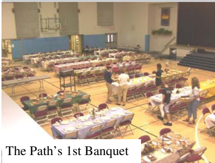
The Path's 1st Banquet

We have been truly blessed this year within our mission. With the much needed help of our supporters , we've been able to improve and grow! This year we succeeded in moving our office out into the garage area, making more room in the women/children's house. We have been able to add staff, not one but two part-time night administrators to help ensure safety, as well as guidance, counseling , life skill classes and childcare. We have been blessed with a van to transport our clients for job search, work, bible study and church services. We have a proposed land site for farming and equipment to start, come this new year. We have been able to bless our families with donated cars, to help them maintain work. It is very evident without the faith, love and support of all our supporters, we would not be here with our doors open, helping with the needs of our community. Our supporters help make all this possible. We thank you for helping us to help others. Our prayer is... that God continues to pour out His blessings on you, fulfill your needs and keep you safe. May His presence always be known and with you always. Thank you, from all of us here at the Path