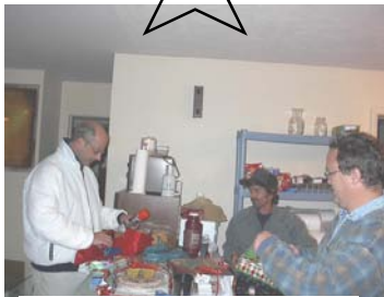
Men's Christmas 2003

Do you have a gulf cart your not using ?Maybe you would just like to donate it to the mission for our ladies to practice their driving skills. Some have never driven nor had a license before!!!