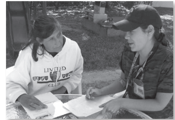
I have people who care

For only $1.57 a meal, you could change someone's life this summer. Make this a summer of hope for the many men and women who call The Path "home" each night. Support The Path's 2014 Summer of Hope Campaign through your giving.