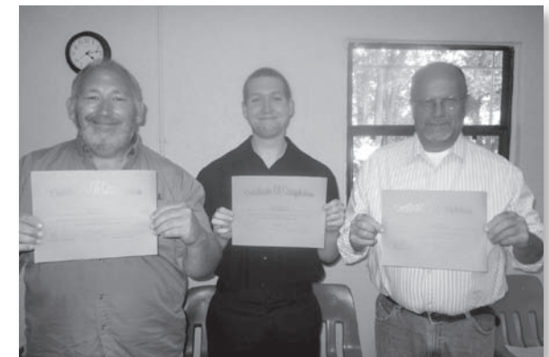
We have hope to start over