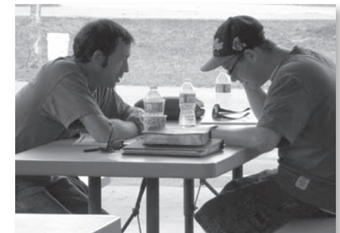
I have a relationship with God

"For I was hungry and you gave me something to eat, I was thirsty and you gave me something to drink, I was a stranger and you invited me in." ~ Matt. 25:35 NIV