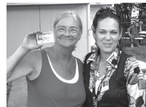
My grandkids have their grandmom again

"For I was hungry and you gave me something to eat, I was thirsty and you gave me something to drink, I was a stranger and you invited me in." ~ Matt. 25:35 NIV